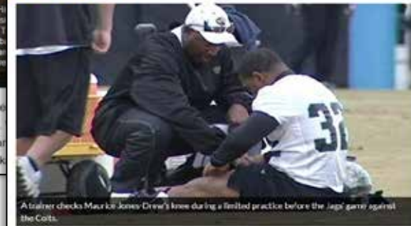
A trainer checks Maurice Jones-Drew's knee during a limited practice before the Jags' game against the Colts.

Posted: 3:45 PM, July 30, 2015 Updated: 3:45 PM, July 30, 2015