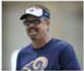
Rams defense riving up under Williams Foundation is solid and players have a new medical system, so it's time to start